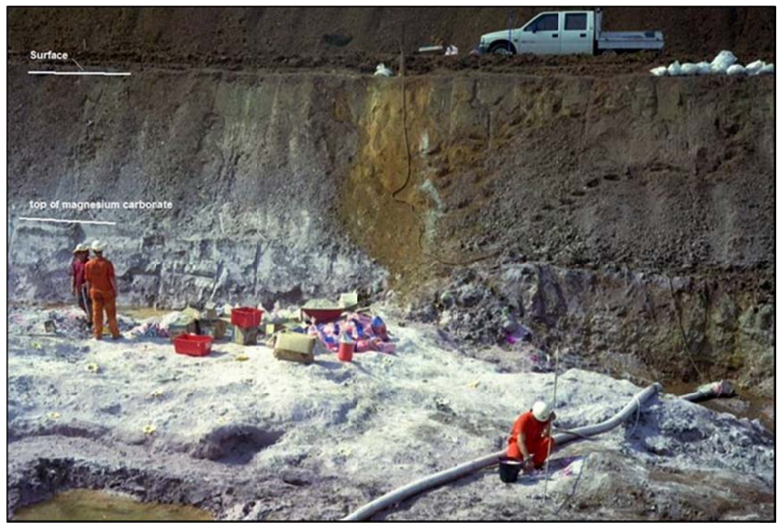
Figure 2 Test mining of magnesium carbonate at Winchester (setting of explosive charges)