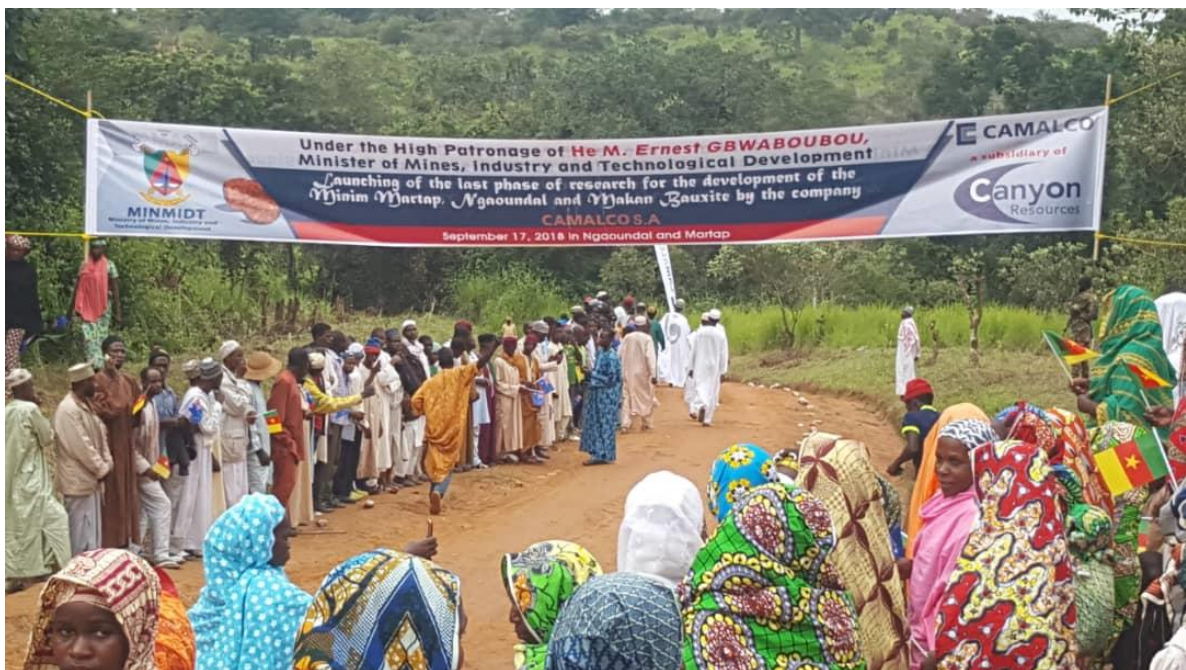
Figure 5: A welcome banner and villagers at the village of Minim

In addition to the launch events, the Minister of Mines ceremonially started Canyon's own drilling rig on the Minim Martap permit to signify the commencement of work on the Project.