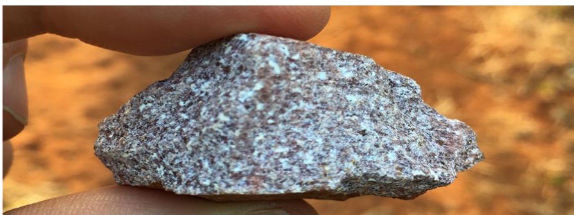
Figure 3: Rock chip sample showing high levels of gibbsite-hosted Al 2 O 3 from a previously untested area.