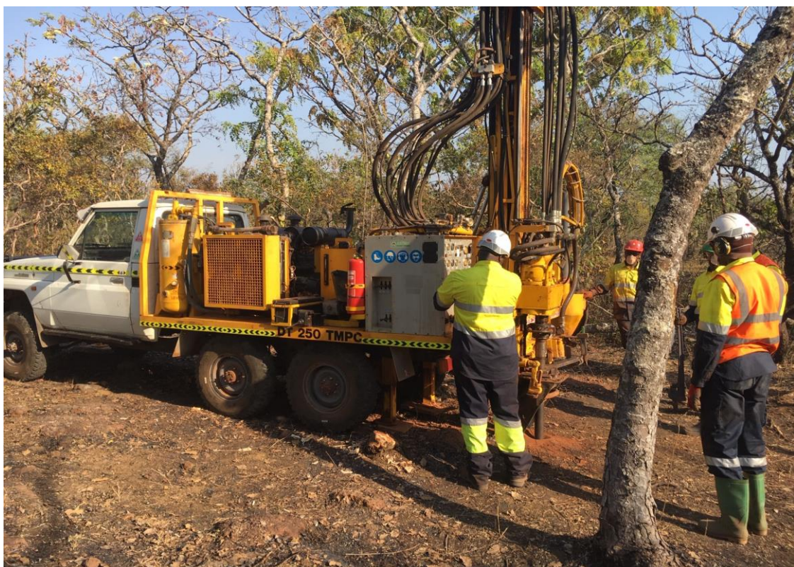
Figure 1: Drilling underway on the high-grade Beatrice bauxite plateau on the Minim Martap Project

Canyon has identified a substantial number of new previously untested bauxite plateaux within the Project area, and the Company now estimates that the drilling completed on the Project by the previous owners tested less than 30% of the available bauxite plateaux.