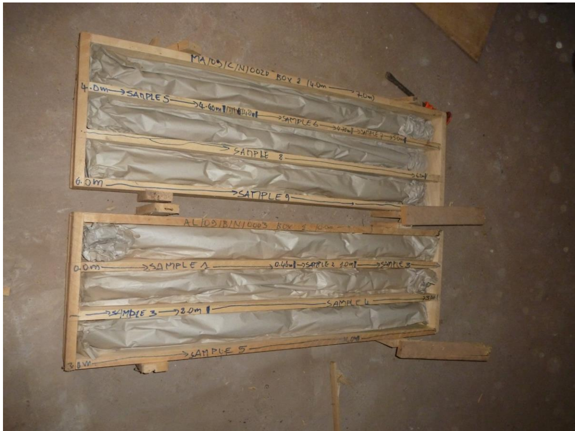
Figure 5: An example of the high quality storage of the drilling core, sealed in wooden boxes and covered

The integrity of the samples is sufficient to use as duplicates for any geochemical refereeing or due diligence that might be required to validate the 2012 JORC compliant SRK resource model. Despite being almost 10 years old the samples are in excellent condition and can easily be matched up with the sample numbers in the previous database.