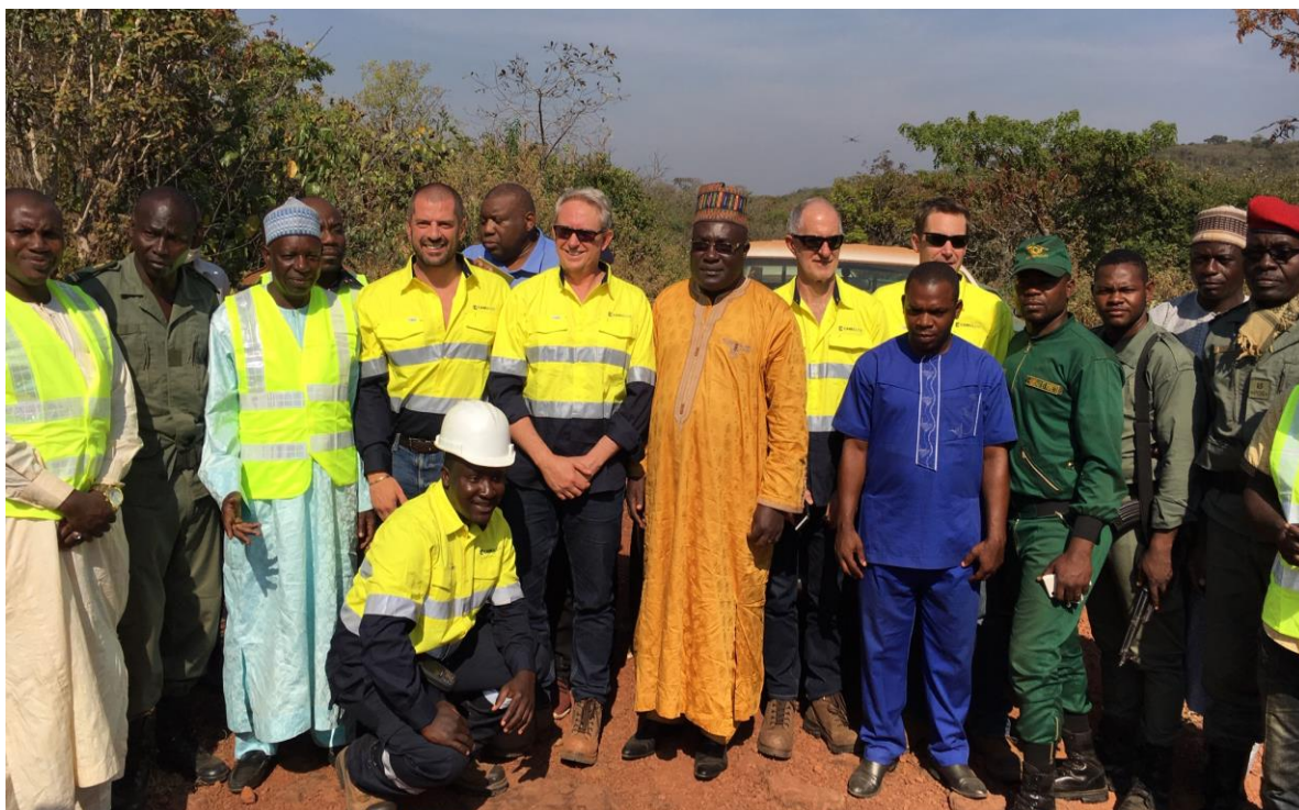
Figure 9: Canyon Board and Management representatives with the Préfet and Sous-Préfet of the Tibaati Region.