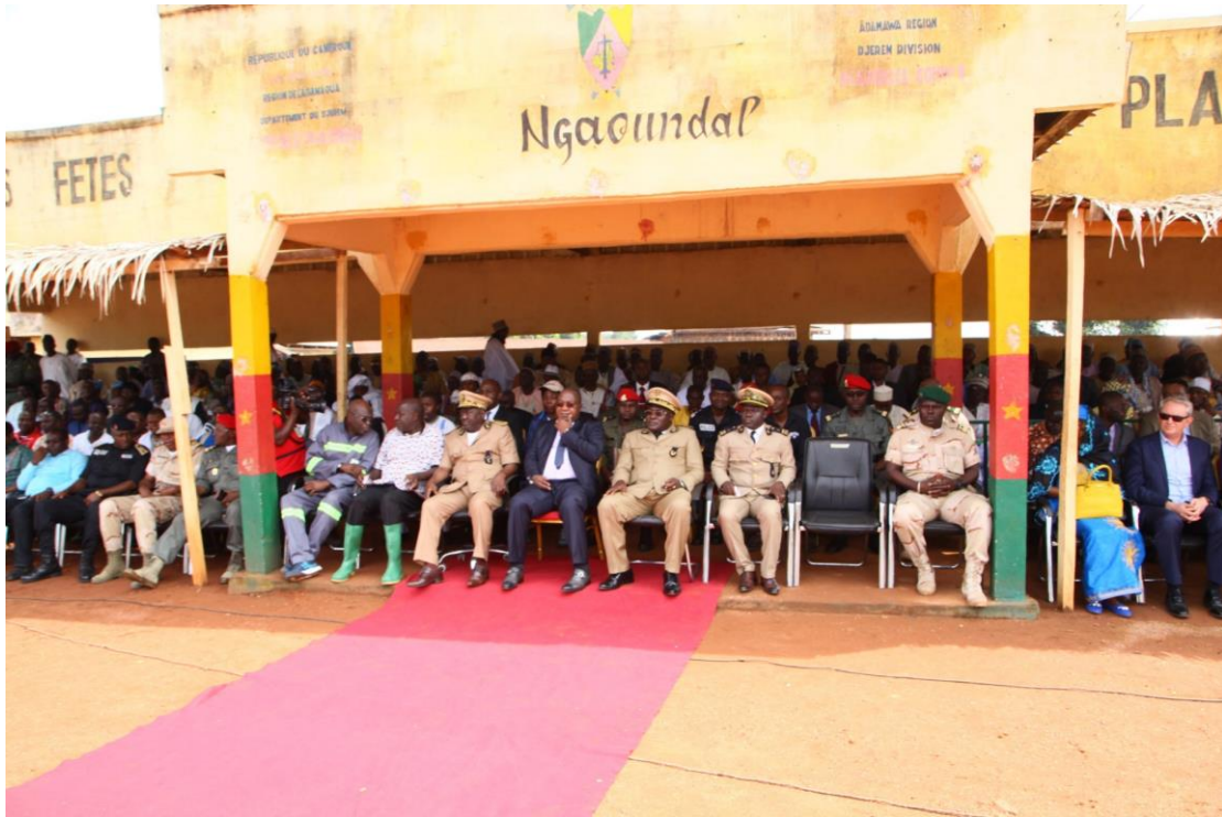
Figure 4: Official delegation for ceremony in the town of Ngaoundal