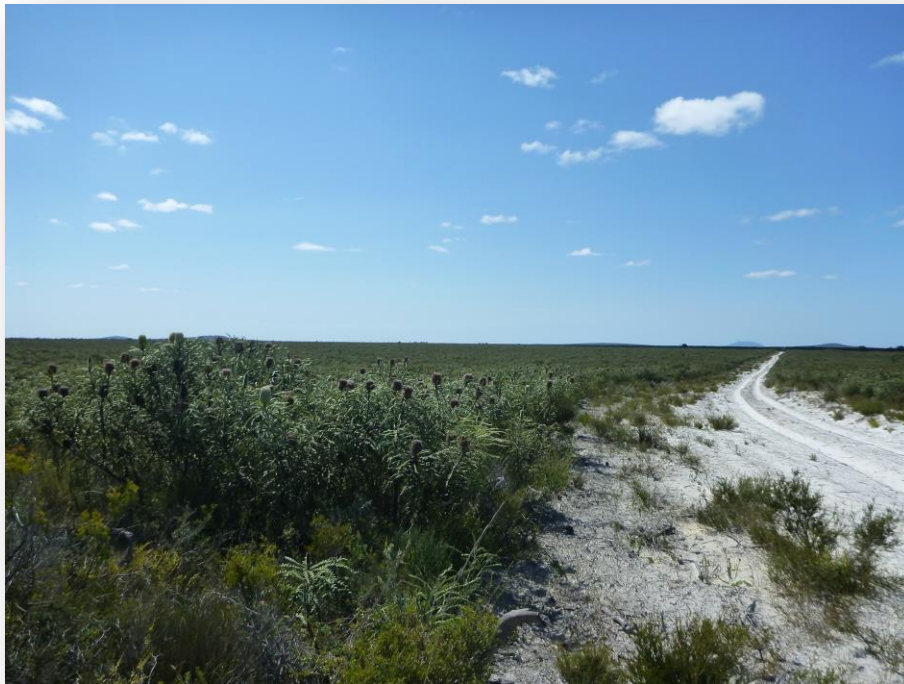
Figure 2. Project Vegetation

Currently access is limited however a 4.5m hand auger hole was sampled each metre down hole which showed the sand to be fine and pale yellow, with some laterite layers and ended in a stronger laterite layer (see Figure 3. below).