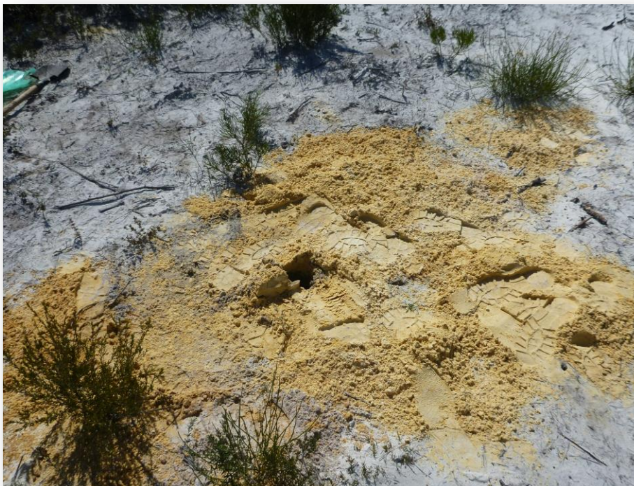
Figure 3. Hand Auger Sand

Currently access is limited however a 4.5m hand auger hole was sampled each metre down hole which showed the sand to be fine and pale yellow, with some laterite layers and ended in a stronger laterite layer (see Figure 3. below).