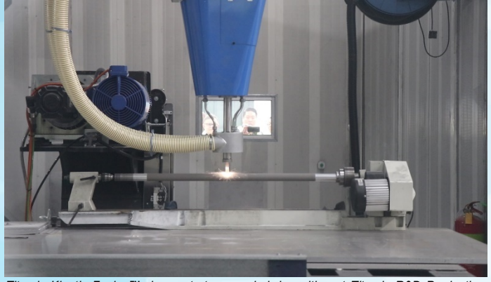
Titomic Kinetic Fusion™ demonstrates mandrel deposition at Titomic R&D Production Centre in Melbourne yesterday.

As an example, the oil & gas industry are one of the world's largest users of valves. The inventory required and the lifecycle of these valves and fitting components is significantly influenced by sediments, sand, rock and other abrasive matter running through the pipe and fitting components during the extraction process. These new patents and knowledge capabilities will allow Titomic to produce piping, valves and fitting components with a significantly higher wear resistance than current piping being used.