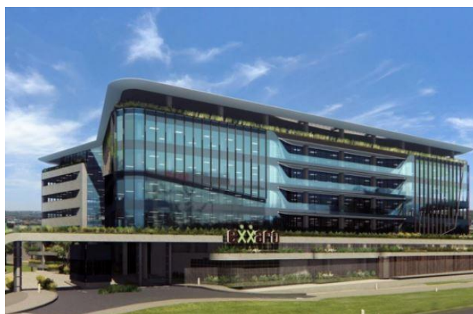
Artists impression of new Exxaro office at West Street, Centurion, Pretoria

GrowthPoint are to integrate the purchased panels into a project they have been completing for prominent South African mining company Exxaro, in Centurion, Pretoria, South Africa. The project was completed in conjunction with green building electrical engineering consultants Conscius Consultants, who will assist with the implementation of the ClearVue PV innovation solution into the new building.