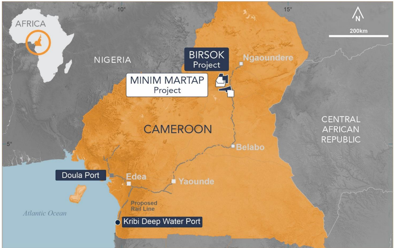
Figure 3: Location map of the Minim Martap & Birsok Bauxite Projects and proximity of Camrail rail line in Cameroon.