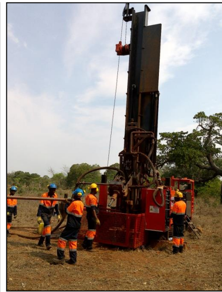
Figure 1: Field photos of the aircore drilling at Koko Massava hole location 19CCAC112 (left) and 19CCAC114 (right).