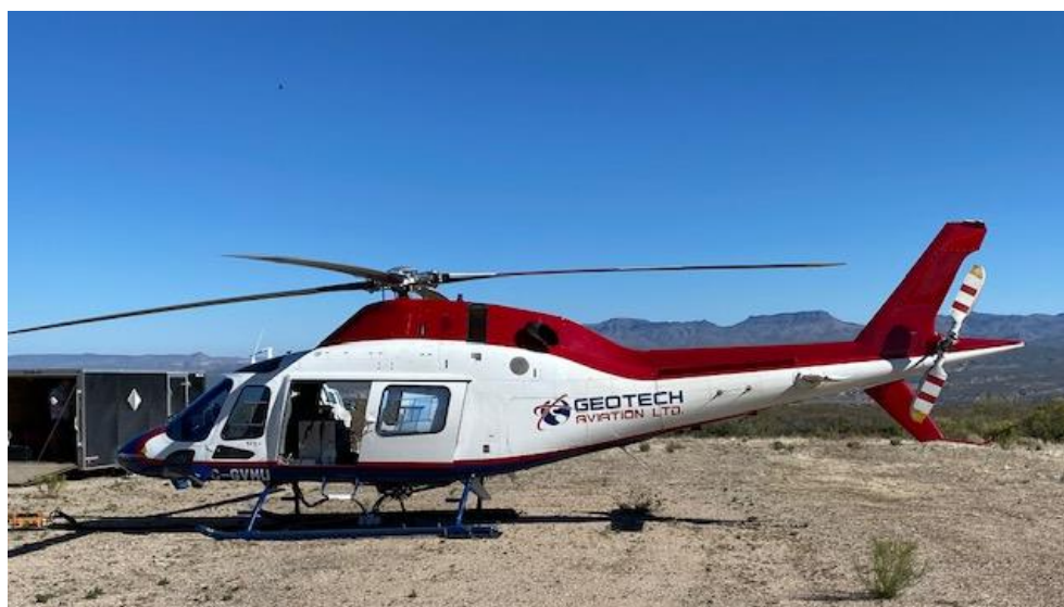
Helicopter VTEM™ Plus survey in progress at Oracle Ridge

The VTEM™ Plus system is designed to locate discrete conductive anomalies as well as mapping lateral and vertical variations in resistivity. The shallow dipping, conductive nature of mineralisation at Oracle ridge means VTEM™ Plus is an appropriate system for defining prospective anomalies.