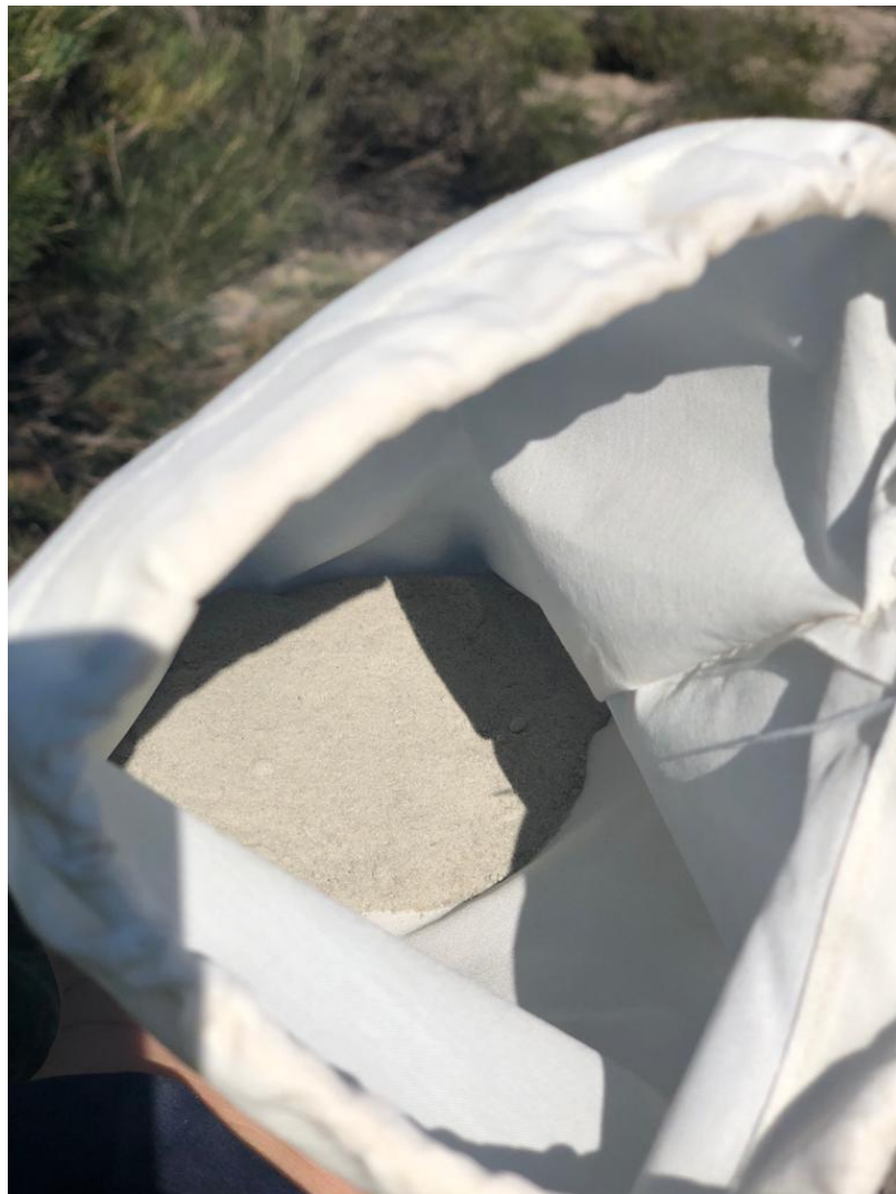
Sample Bag Full of White Sand Collected During September 2020 Drill Program at Beharra

The program also demonstrated consistent intersection of pervasive white sand sequences across the Beharra tenement, which is the target sequence of Perpetual, due to its comparatively lower processing complexity as compared with yellow sand sequences.