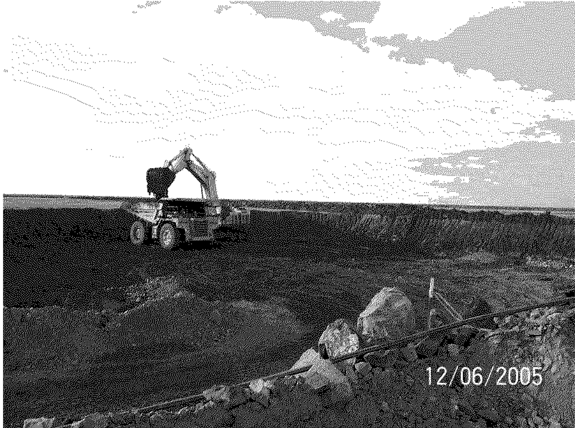
Pre-stripping of Williamson

Open pit mining commenced at Williamson in the first week of June 2005. Stripping of 2-3m of lake sediment is progressing as planned and the first batch of oxide ore is expected to be milled in the last week of June.