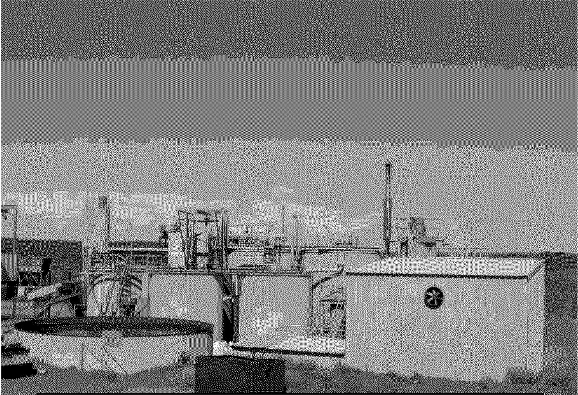
BURBANKS PROCESSING FACILITY NEAR COOLGARDIE WA