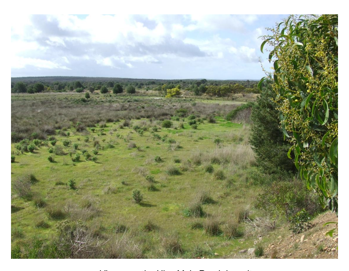
View over the Uley Main Road deposit

At this stage no decision has been made regarding the infill drilling recommended by Coffey Mining. At present there are a number of international companies that have signed confidentiality agreements in order to review the available data on the Project. We are confident a partner will be found for the Project in the not too distant future. The goal is to mine our world class deposit and get it back into production as soon as feasibily possible.