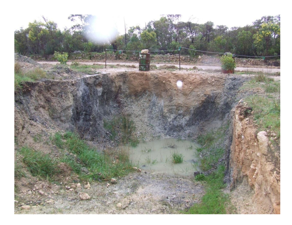
Figure 1: On the side of road at Uley Main Road deposit