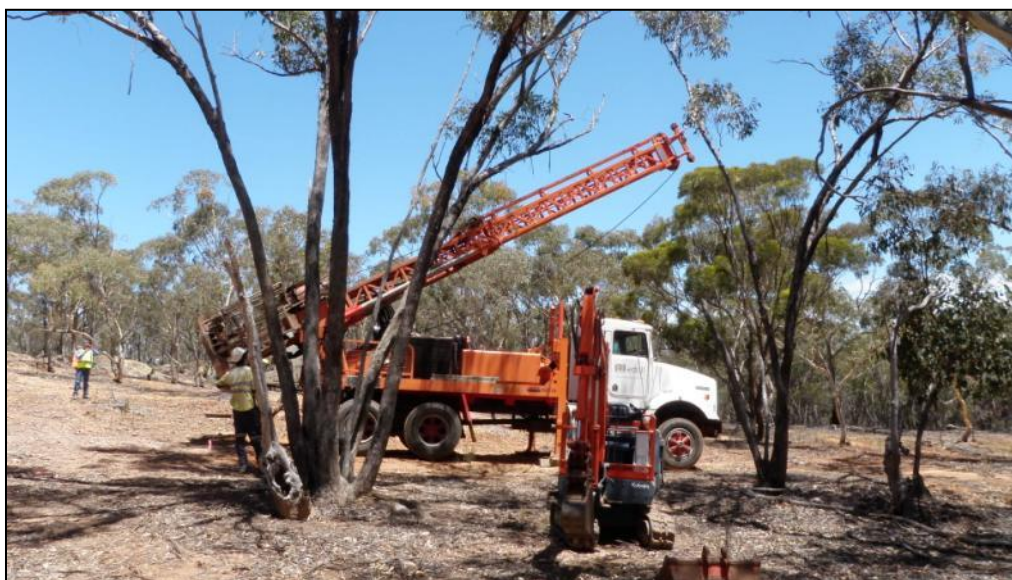
Edrill Diamond Rig setting up on site