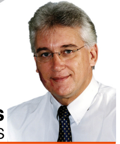
Kon Vatskalis MINISTER FOR RESOURCES