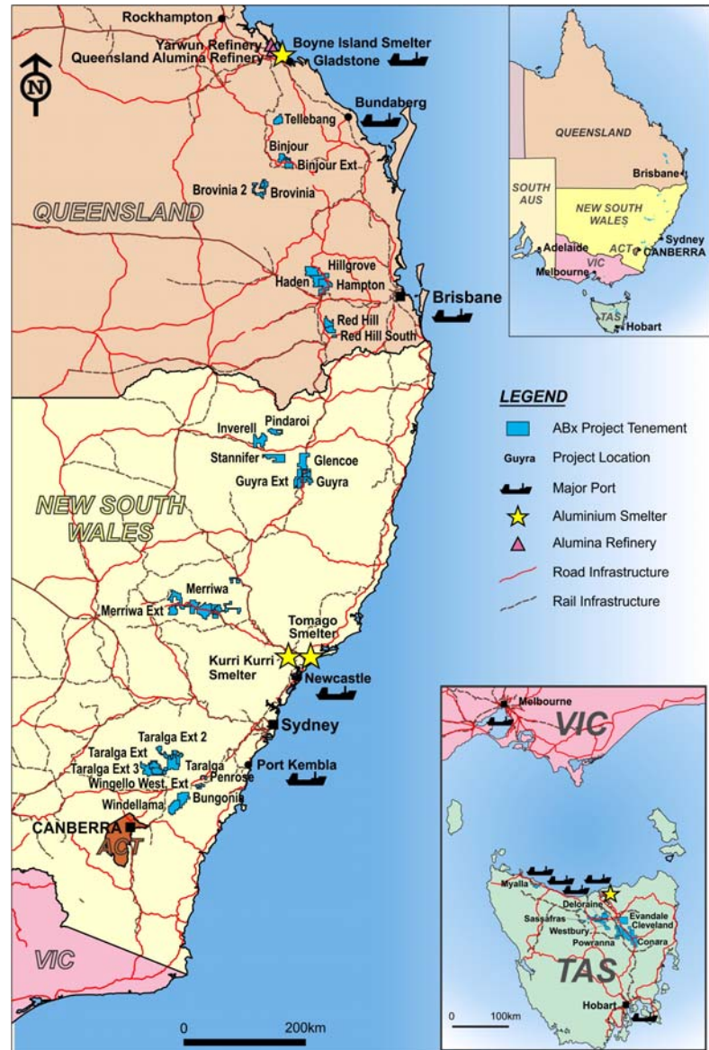
Figure 3: Project Tenements and Major Infrastructure – 2Qtr 2012