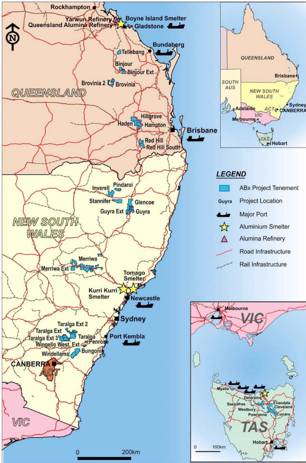
ABx Project Locations