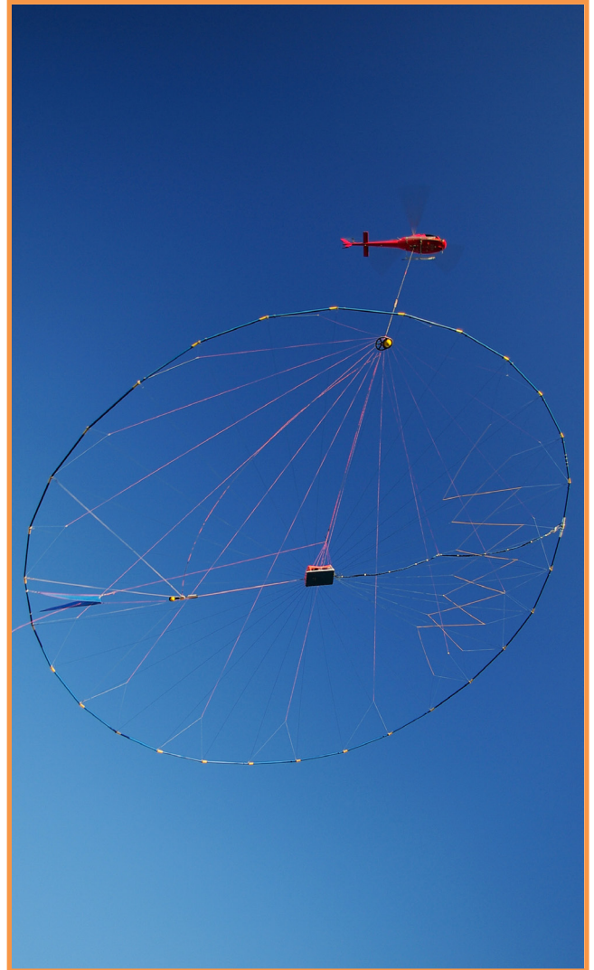
Figure 3: Fugro's HELITEM system in flight.

Combining the gravity data with good quality conductivity data over the target area will significantly improve the potential for drilling success.