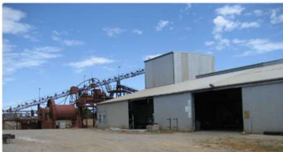
Uley processing plant- capable of producing up to 14,000 tonnes of graphite per year

A resource upgrade was conducted at the project in January 2011 by Coffey Mining following analysis of approximately 1,200 metres of infill drilling, with an indicated resource estimate of 4.3 million tonnes and inferred resource of 2.3 million tonnes at a grade of 8.7%.