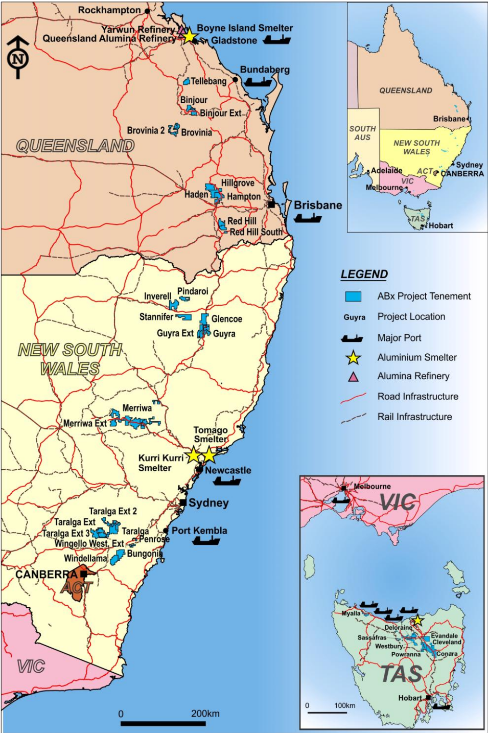
Figure 3: ABx Project Tenements and Major Infrastructure