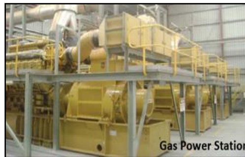
Gas Power Station