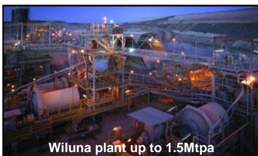
Wiluna plant up to 1.5Mtpa

The Wiluna plant operated up until June 2013. Blackham's ability to use the plant in its current location considerably reduces the cost of developing the free milling open pit Matilda deposits. Following a stringent development decision, Blackham intends to refurbish, then recommission the plant using both ball mills for its free-milling ore. Mining studies and metallurgical testwork to date on its Matilda Mine suggests the plant can achieve 1.5 Mtpa at 2.0g/t and 90.5% recovery for 88,500 ounces gold. Blackham intends to moth-ball the refractory circuit for possible future use.