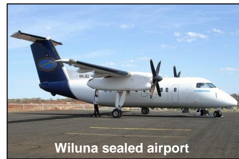
Wiluna sealed airport