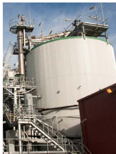
Fig 6: Bioconversion vessel number one (V1) (March 2014).