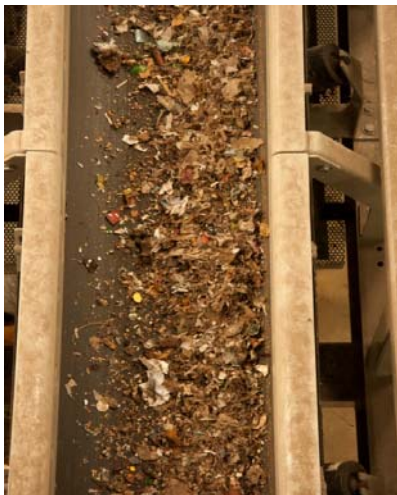
Fig 3: Post-trommelled fraction of MSW conveyed into Wet Density Separation system (March 2014).