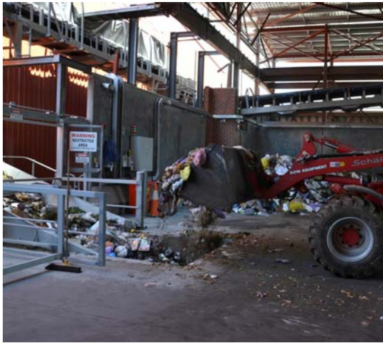
Fig1: Municipal solid waste (MSW) loaded onto trommel (March 2014).