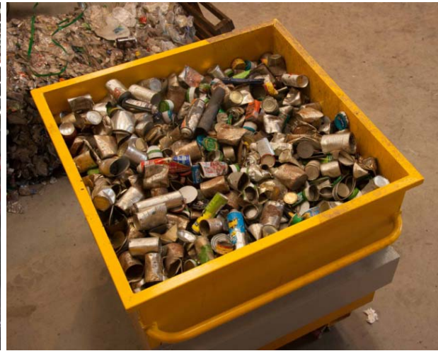
Fig 2: Ferrous metal recyclables recovered from MSW (March 2014).