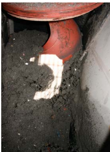
Fig 5: Organic fraction post Wet Density Separation conveyed into bioconversion vessel V1 (March 2014).