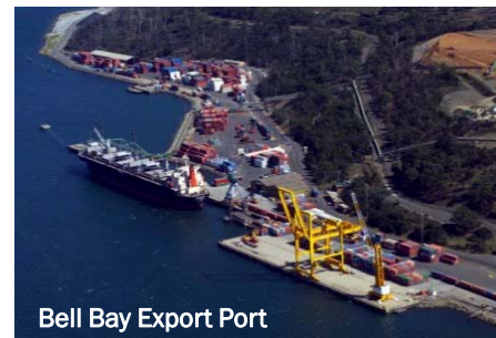
Bell Bay Export Port