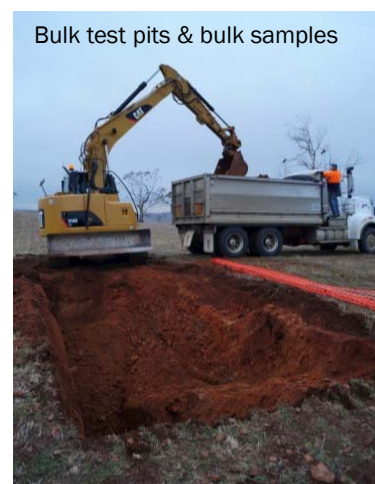
Bulk test pits &amp; bulk samples