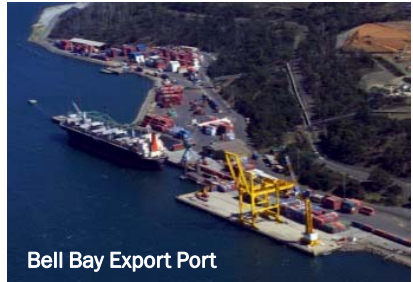
Bell Bay Export Port