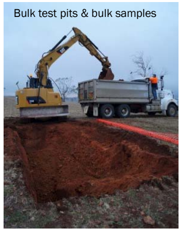
Bulk test pits & bulk samples