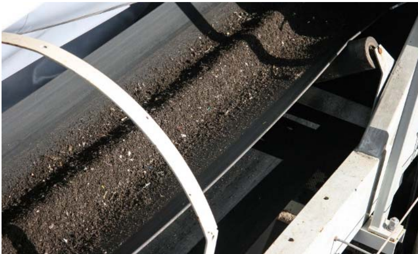
Figure 3: Organic fertiliser unloaded from DiCOM™ bioconversion vessel at the end of Ramp-up Batch #4.