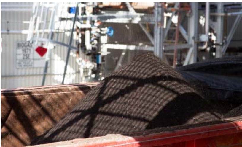
Figure 4: Organic fertiliser loaded into truck for delivery to off-taker for assessment. Batch #4.