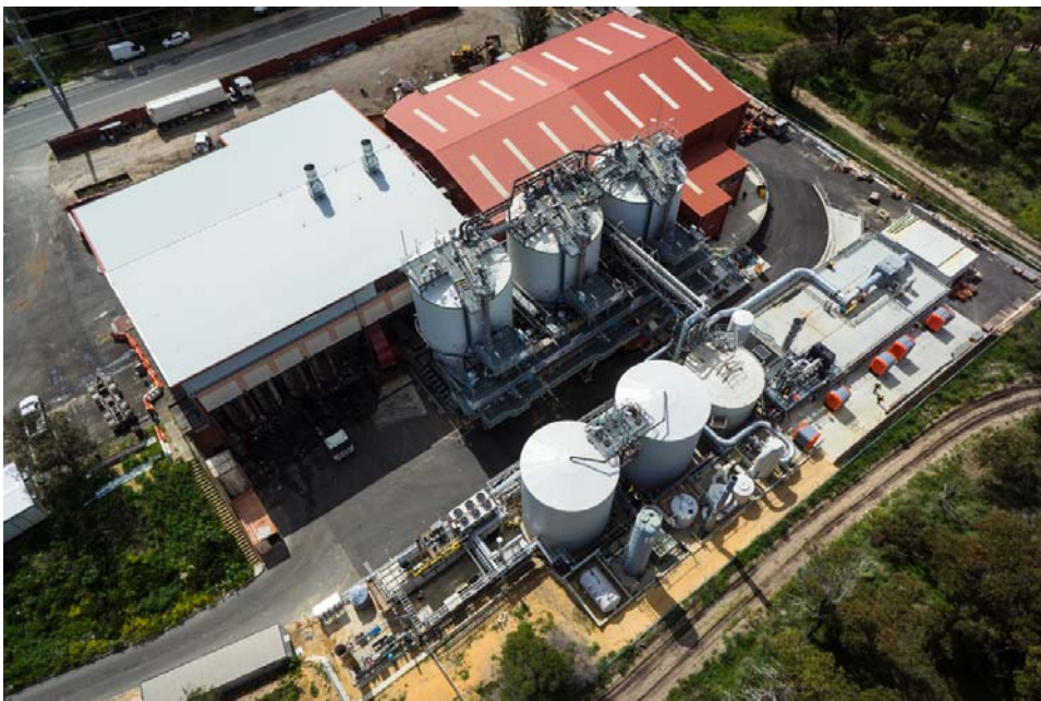
Figure 5: AnaeCo™ AWT Plant at WMRC JFR McGeough Resource Recovery Facility, Shenton Park, Western Australia

The WMRC Project is the first full operational scale installation of the AnaeCo™ System and is a transfer station retro-fit occupying less than 4,000m 2 .