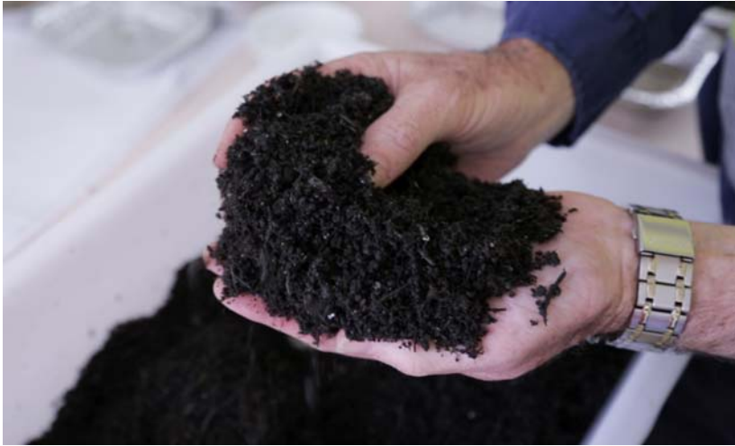
Figure 2: Sample of organic fertiliser removed from Ramp up Batch #4.

Following is a selection of pictures from the removal of organic fertiliser at the end of Ramp-up Batch #4, October 2014.