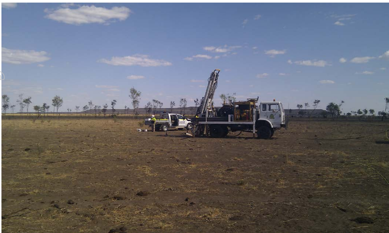
Figure 2: First hole of aircore grid drilling program at FC4S Sevastopol graphite project. Ernest Henry mine waste dumps visible in the background.