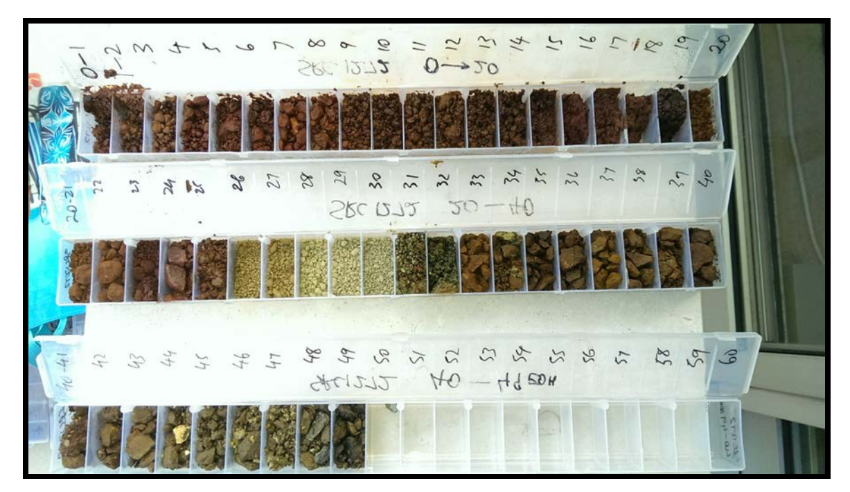
Figure 3: Hole SRC1272 chip tray showing 1m intervals through laterite profile, ending in basement ultramafic

Two meter samples were collected using a riffle splitter on the drill rig then sent to ALS in Brisbane via preparation lab in Orange to be assayed using both ICP-MS and Borate Fusion analytical techniques. Both Techniques were used to assess any differences in the scandium results for future reference and to assist with interpretation of historical drill results. One fully certified scandium standard and two identical duplicates per hole were also assayed for QA-QC purposes.