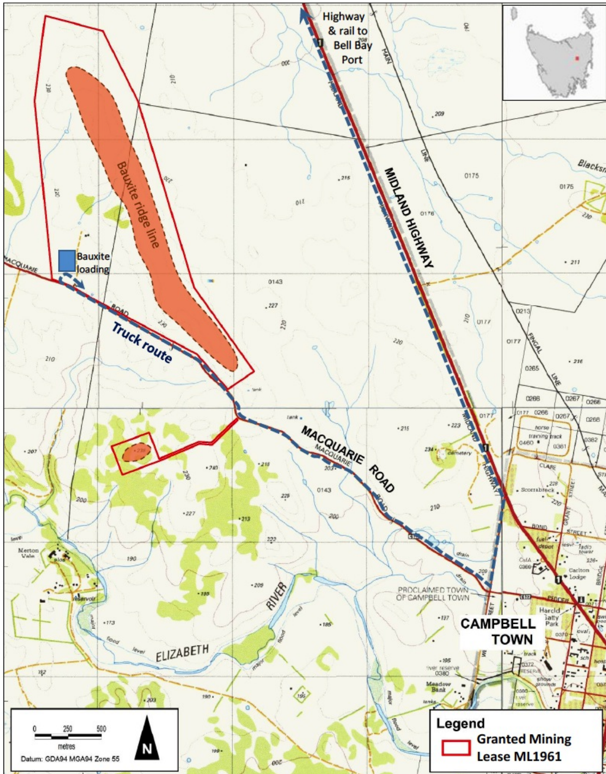
Figure 3: Bald Hill Mining Lease ML1961, Campbell Town, Tasmania