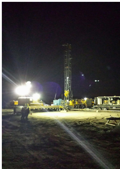
PIERRE C18#3 WELL

The Company looks forward to the future development of this world class property in 2015.