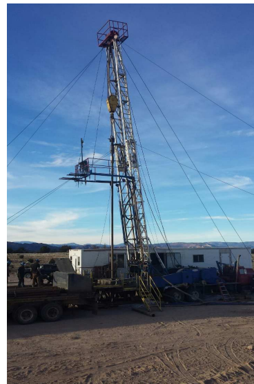
PIERRE C18#4 WELL