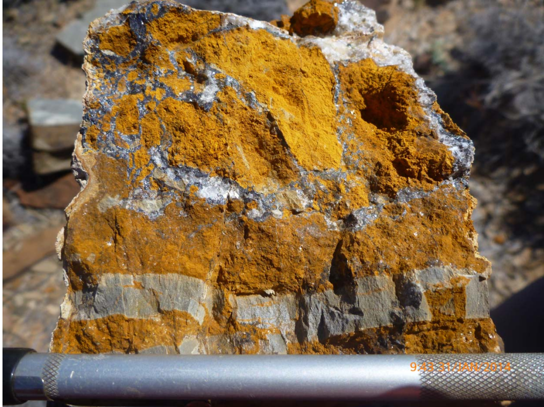
Figure 1. Example of Yerelina Zn-Pb-Ag vein style mineralisation associated with iron-rich carbonate alteration in brittle fractured Tapley Hill Formation.