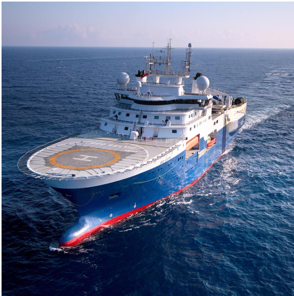
Figure 1 - Geo Celtic 3D seismic survey vessel

The objective of the survey is to acquire approximately 1,250 km 2 of 3D seismic data which will allow leads (currently defined on 2D data) to be matured for drilling and enable a farmout process to commence later this year.