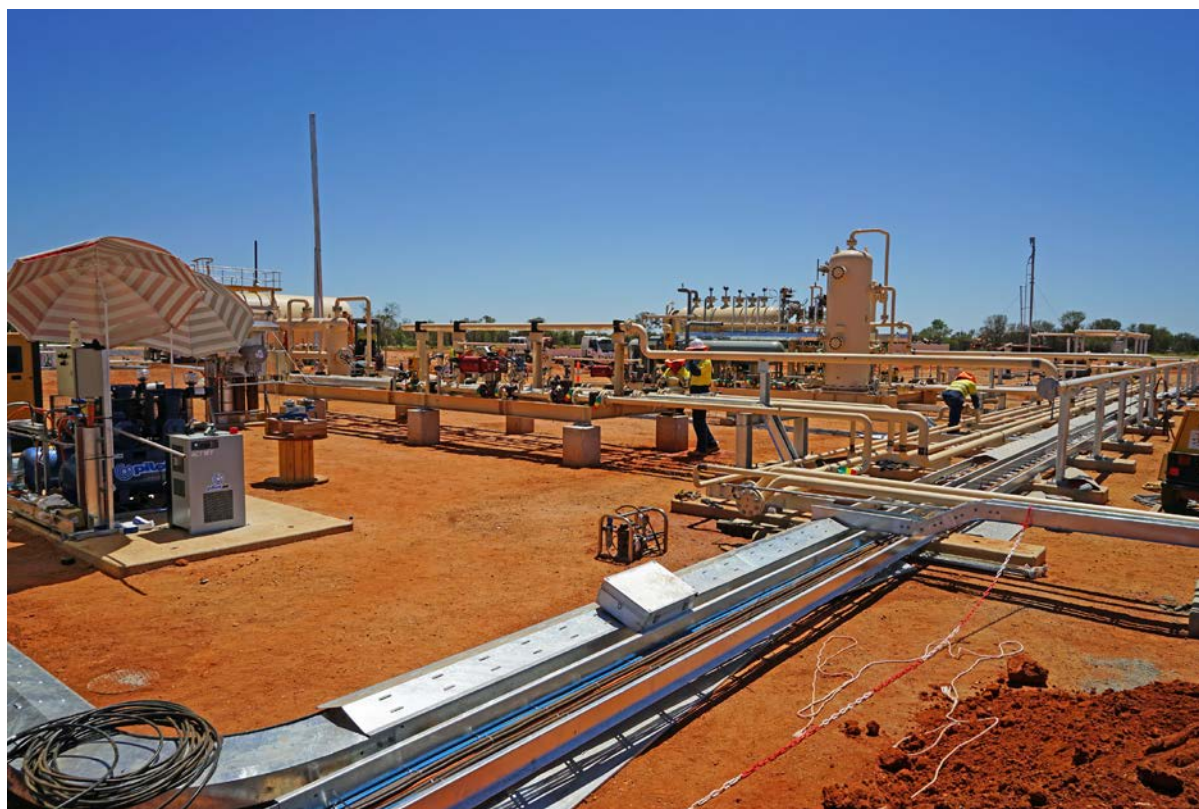
Figure 2: Brewer Estate Gas Plant (Dingo Project) showing good progress in mid-February