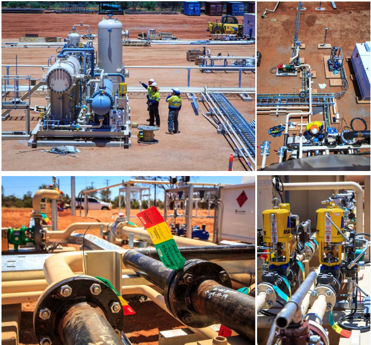
Figure 3: Commissioning underway on Dingo Project