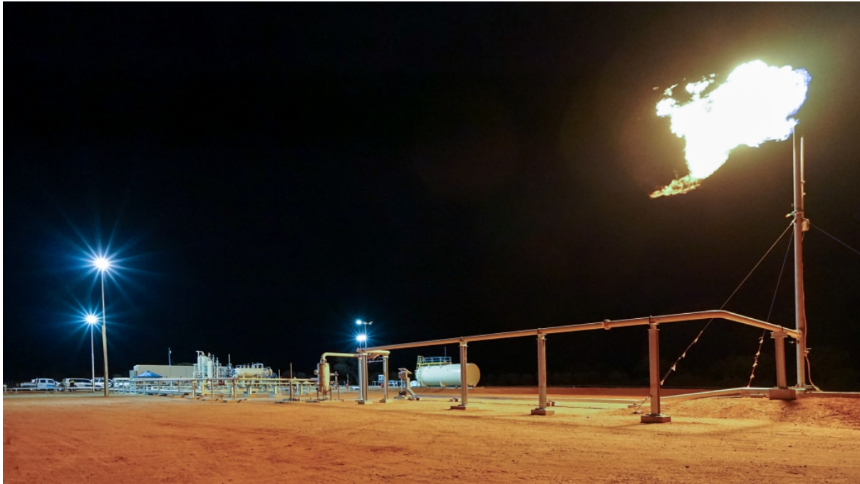
Figure 1: DINGO PROJECT – Brewer Estate City Gas Station (“BECGS”)