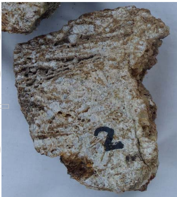
Picture 1 - Sample FFNP2, 14.85 grams/tonne Gold and 53.90 grams/tonnes Silver. Costean, Frasers Find. Portion of extensively oxidised vein comprised of prismatic and brecciated quartz associated with limonite and scorodite after sulphides. Sample: 4.2x7cm.

Sovereign Gold Company Limited, Telephone: +61 2 9251 7177