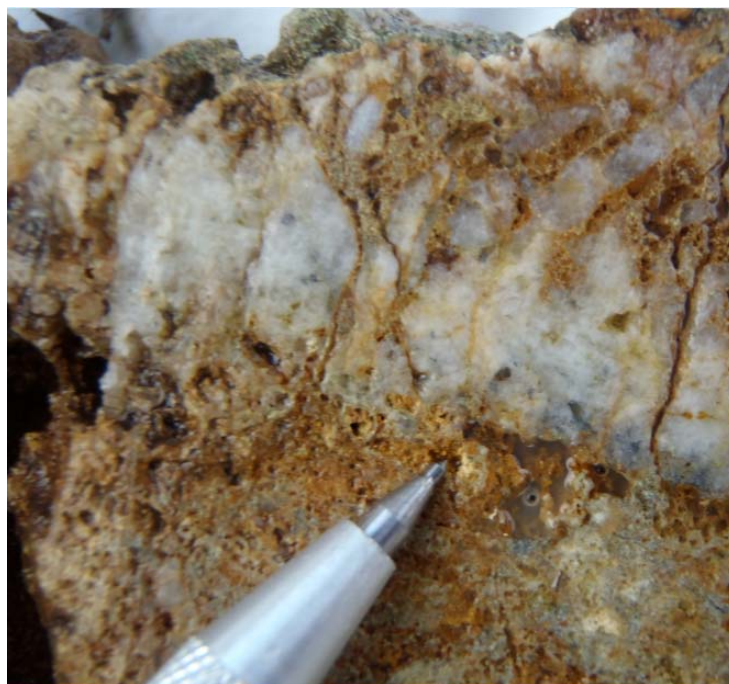
Picture 2 - Sample FFNP6, 13.50 grams/tonne Gold and 44.50 grams/tonnes Silver. Costean, Frasers Find. Portion of extensively oxidised vein comprised of prismatic and brecciated quartz associated with limonite and scorodite after sulphides. Scribe point for scale.