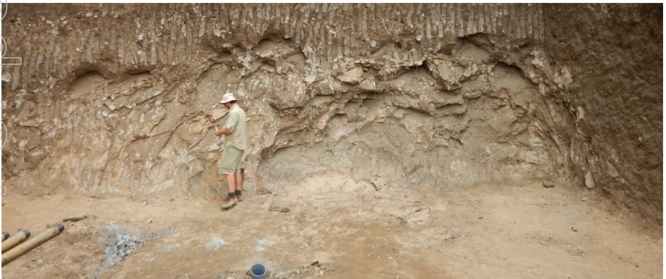
Photo 1. Ulanzi drill pad showing extensive graphite mineralisation

Drilling continues the adjacent Ulanzi prospect, where 17 holes have been completed and at least another twenty drill holes are planned. Step-out test pitting and trenching to the south has successfully extended the mineralisation strike length from 2.5km to 3.75km, a 50% increase. Ulanzi is substantially larger than Cascade.