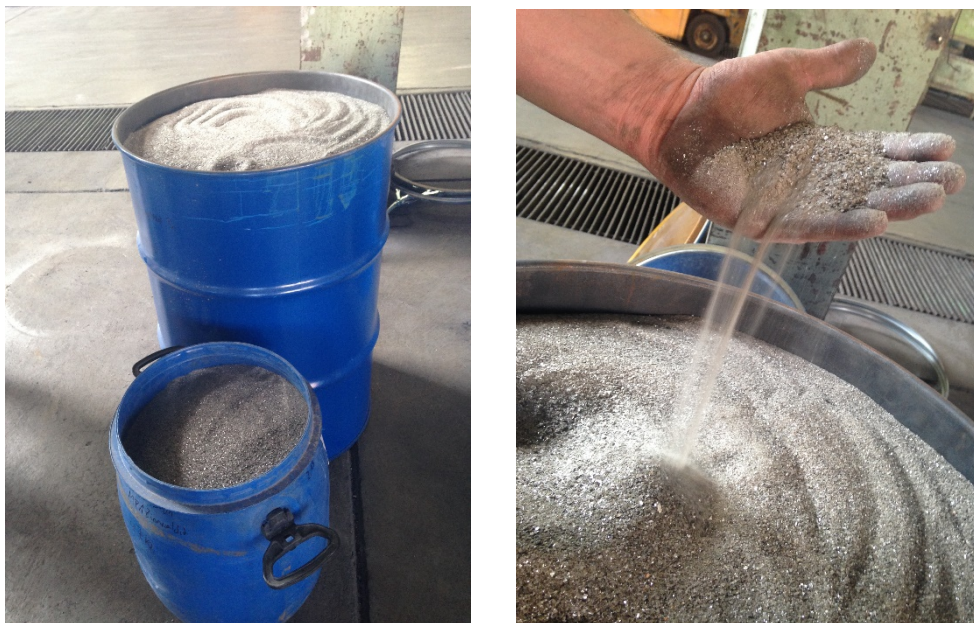
Figure 1: Lithium mica concentrate

The bulk sample was ground to 1,200 micron and run through a high intensity dry magnetic separator, producing concentrate weighing 420kg and averaging 2.5% Li 2 O. This concentrate was then ground to 80% passing 30 micron before packaging and transport to Australia for the planned lithium carbonate mini-plant run.