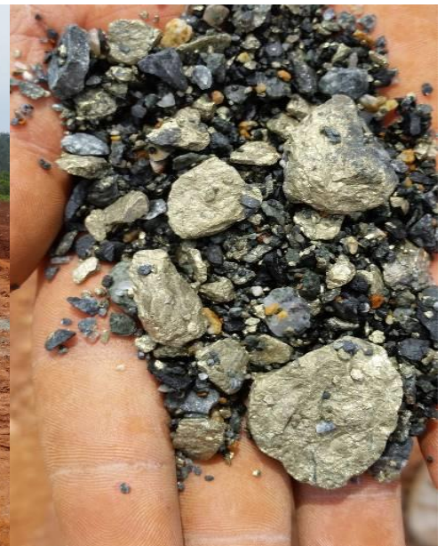
Massive chalcopyrite in RC chips