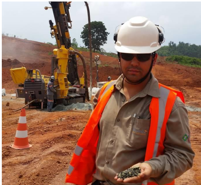
Mine Geologist responsible for logging grade control