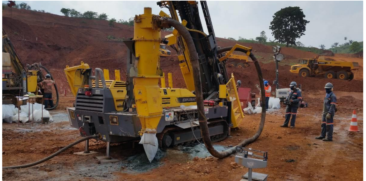
Remotely operated grade control rig on the pit bench floor

Within the orebody high grade gold zones are also becoming more apparent, adding to confidence and showing the potential for upside.