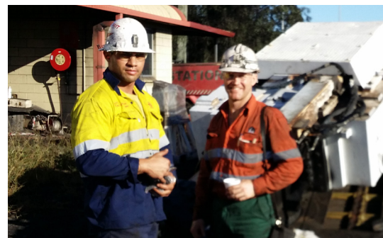
Mobilising Kestrel Development Contract

Overall the outlook for the Mastermyne Division continues to be quite positive mainly supported by the increase in tendering opportunities over the first quarter and some reasonable growth in the pipeline. We are experiencing increased tenure in the contracts we are tendering and the majority of tenders relate to work supporting production activities in the underground operations.