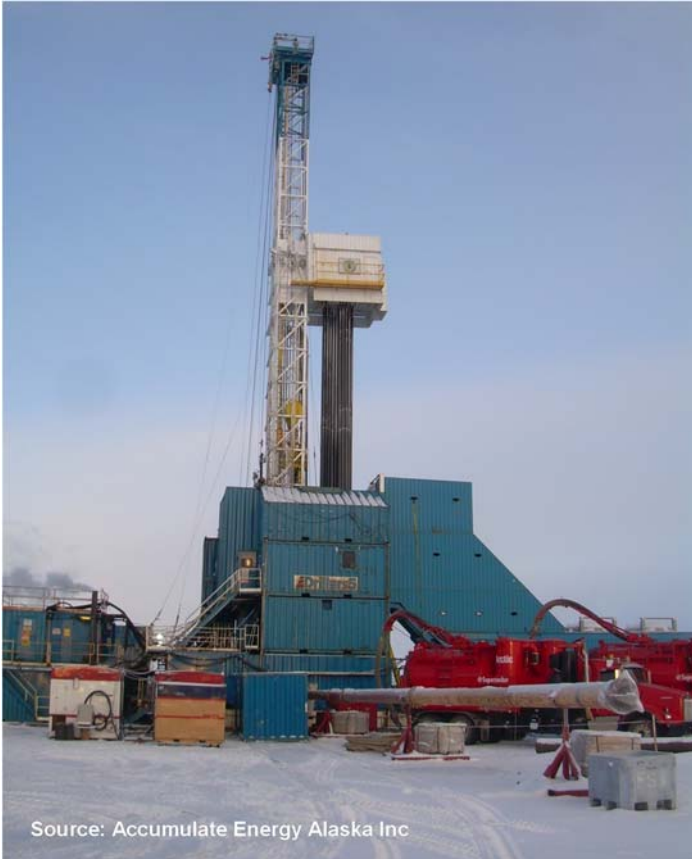
Fig 1. Kuukpik Rig 5 On Location

Upon completion of drilling, certain data will be available immediately and will be reported to the market after internal examination; however, the definitive testing of the HRZ shale potential will take several months of data analysis. The pivotal focus will be an extensive evaluation of core material by specialist laboratories, which will cover a number of parameters considered critical for the success of the play.