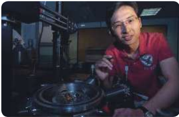
Weebit's memory chips being prepared for shipment to the ISS

After 2 years in space, exposed to harsh radioactive solar and cosmic rays, Weebit's memory devices were still functioning, with zero deterioration or loss of performance. As a result Weebit's memory chips have received a "Hard-Rad" status, meaning that it is largely impervious to the effects of radiation. This renders Weebit's chip material ideal for space missions, satellite technology, and other radiation exposed applications.