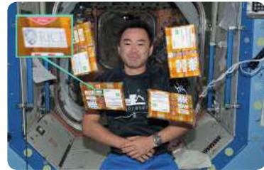
Weebit's chips floating in zero gravity prior to beginning the 2 year test