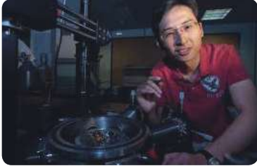
Weebit's memory chips being prepared for shipment to the ISS

After 2 years in space, exposed to harsh radioactive solar and cosmic rays, Weebit's memory devices were still functioning, with zero deterioration or loss of performance. As a result Weebit's memory chips have received a "Hard-Rad" status, meaning that it is largely impervious to the effects of radiation. This renders Weebit's chip material ideal for space missions, satellite technology, and other radiation exposed applications.