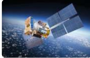
The ISS where the tests were made