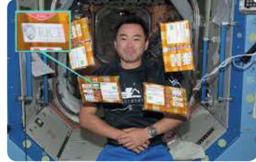
Weebit's chips floating in zero gravity prior to beginning the 2 year test