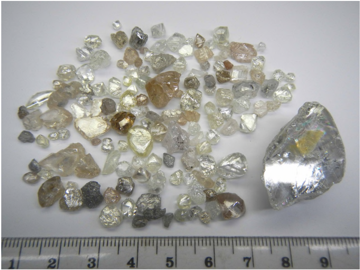
The complete ninth parcel of Lulo diamonds which averaged A$2,360 per carat.