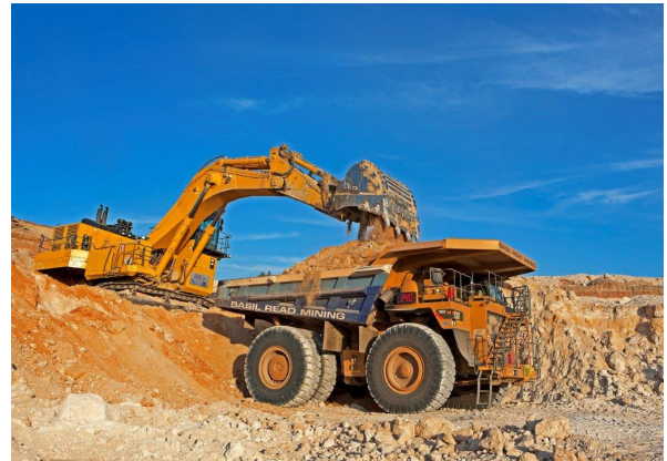
Basil Read Mining equipment in operation.

Basil Read Holdings Limited ( Basil Read ) is one of the leading construction companies in Southern Africa and has more than six decades of construction and open cut mining expertise. Listed within the heavy construction segment of the industrial sector of the JSE Limited (JSE) in South Africa, Basil Read is active in civil engineering projects, road construction, building, mixed-use integrated housing developments, property development, open cut mining and related services. Basil Read Mining Division provides contract mining services across sub-Saharan Africa.