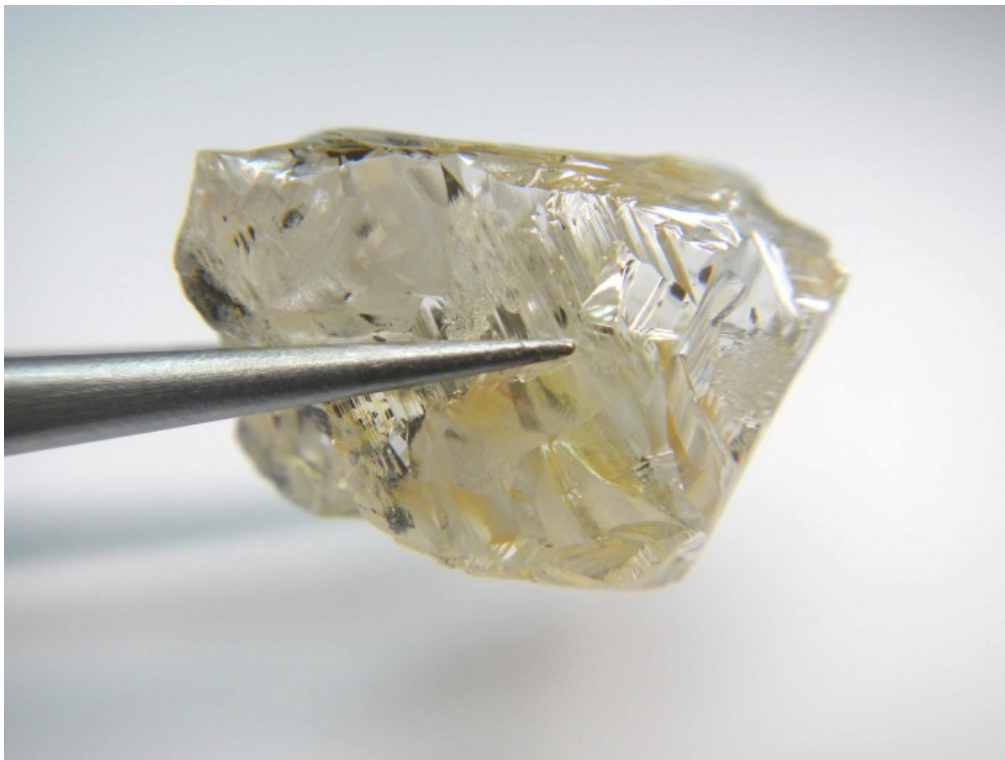
68.1 carat Type IIA D-colour gem recovered from the E46 alluvial terraces at Lulo