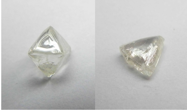
Figure 2: 0.78 carat kimberlite diamond (left) and 0.46 carat kimberlite diamond (right) from L46

E46 is also adjacent to the known diamond-bearing kimberlites L46 and L19 (Figure 1). Lucapa recovered two Type I kimberlite diamonds weighing 1.24 carats in 2015 from preliminary bulk sampling of L46 (See ASX announcement 16 October 2015) (Figure 2).