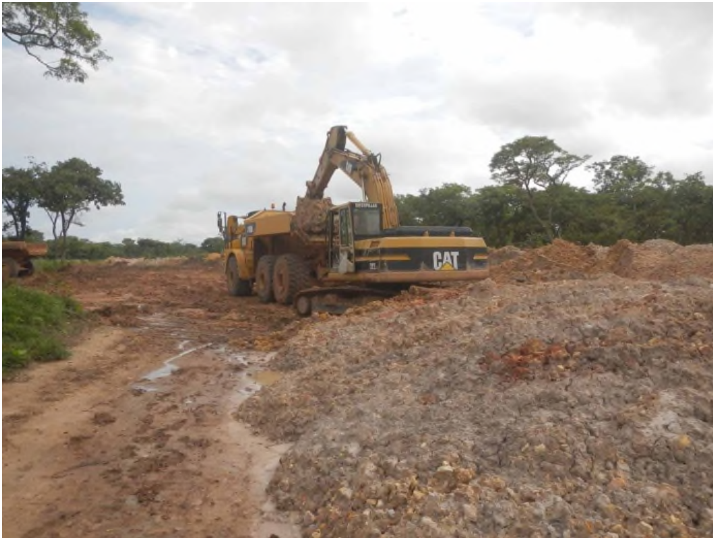
Loading of alluvial gravels from E46 stock-pile area

The E46 area has been a recent focus of Lucapa's alluvial mining activities while access to Mining Blocks 8 and 6 have been restricted due to heavy rains during the Angolan wet season. As referred to in the ASX announcement of 3 March 2016, the wet season generally finishes in April, after which diamond production from Mining Blocks 8 and 6 is scheduled to be scaled back up to the rate of 20,000 bulk cubic metres per month as ground conditions permit.