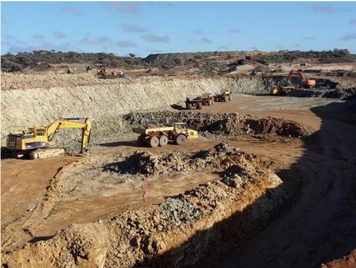
Devon Gold Mine – Main Pit looking north

Further updates will be provided as the development progresses.