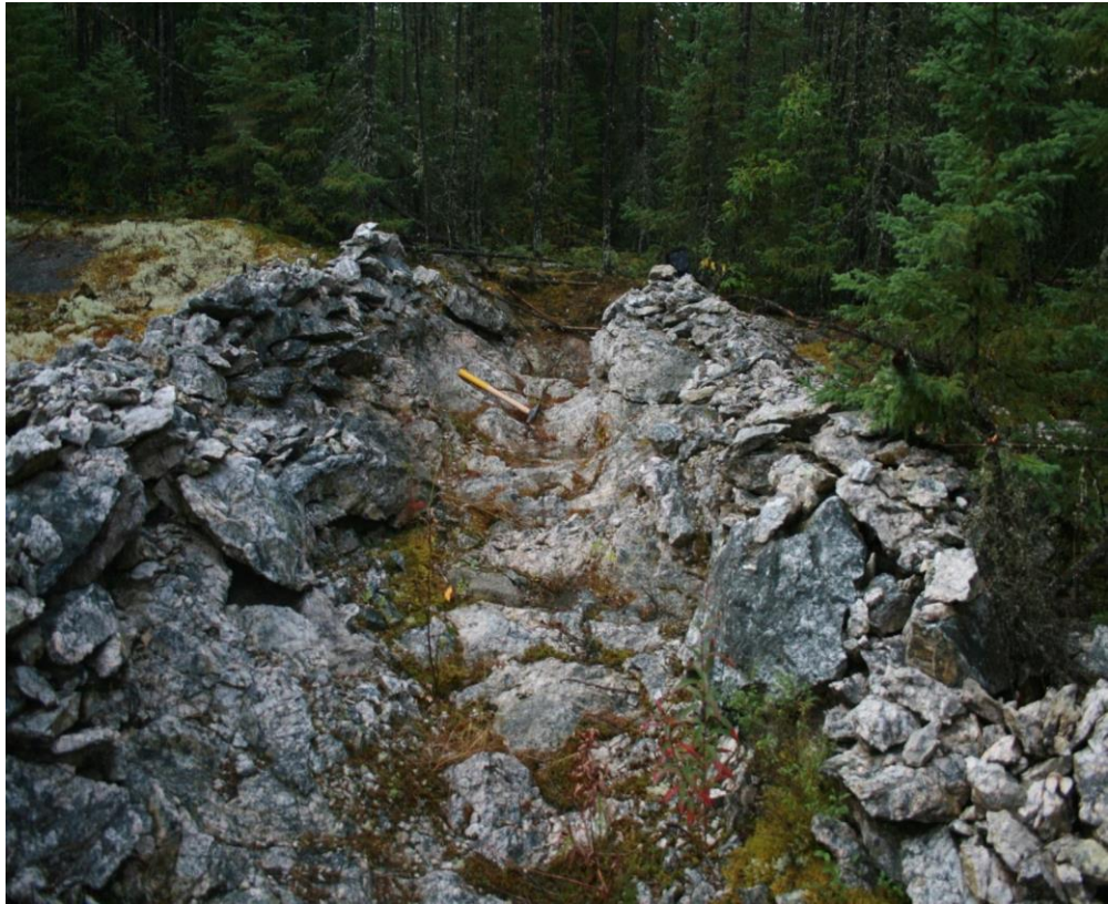
Figure 3. 1955 Historical Trench Sampling of the Pegmatite at Root Lake