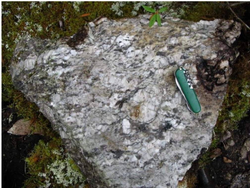
Figure 4. Outcropping Pegmatite identified in 2005 at Root Lake.

The upcoming drilling is a key component of the Company's due diligence review of the project.