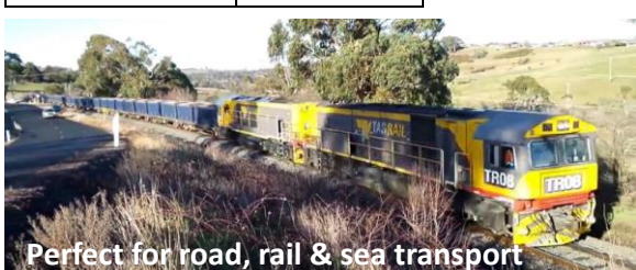
Perfect for road, rail &amp; sea transport