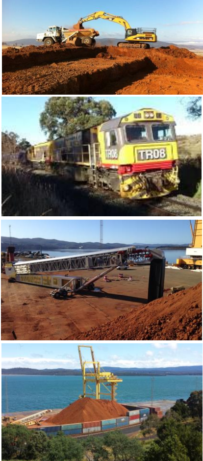
Figure 1: Map showing ABx mines & transport infrastructure in Tasmania. Pictures show (top to bottom):