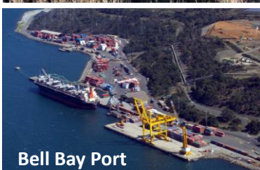
Bell Bay Port