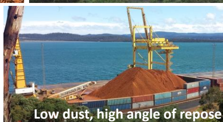
Low dust, high angle of repose