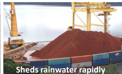
Sheds rainwater rapidly