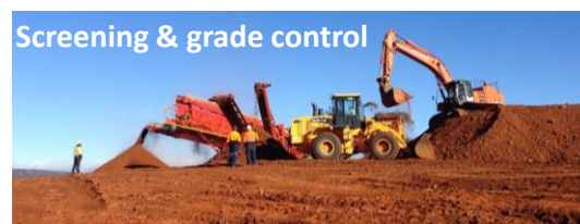
Screening &amp; grade control