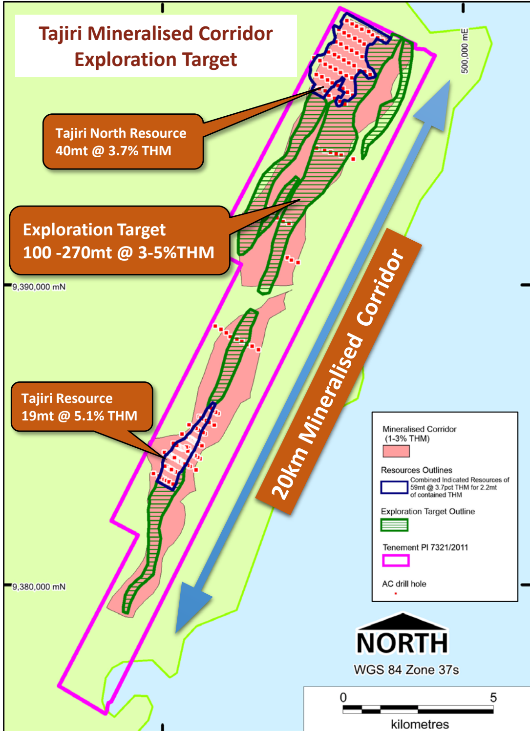
Figure 2. Tajiri Mineralised Corridor with overlying Exploration Target