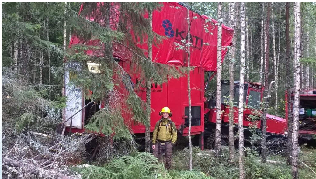
Photograph showing the location of the drill rig on drill hole KMD001 at the Kietyönmäki main pegmatite dyke.