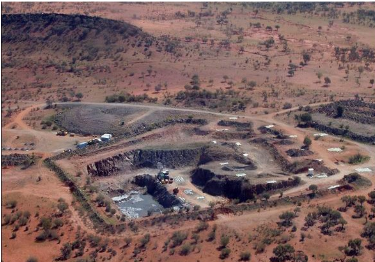
Figure 2: Molyhil Open Pit