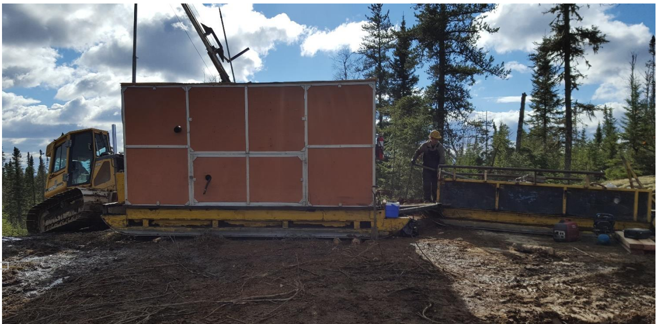
Figure 1. Photo of the Diamond Drill Rig drilling at the North Aubry prospect on the Seymour Lake Lithium Project.

The Company has successfully established the necessary access roads and drill pads at site with the diamond drill program commencing swiftly.