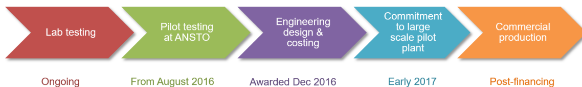
Figure 1. LIT’s path to commercial production

Commercial development of the Sileach™ process involves progressive de-risking and demonstration of the ability to scale up from laboratory tests through to commercial production.